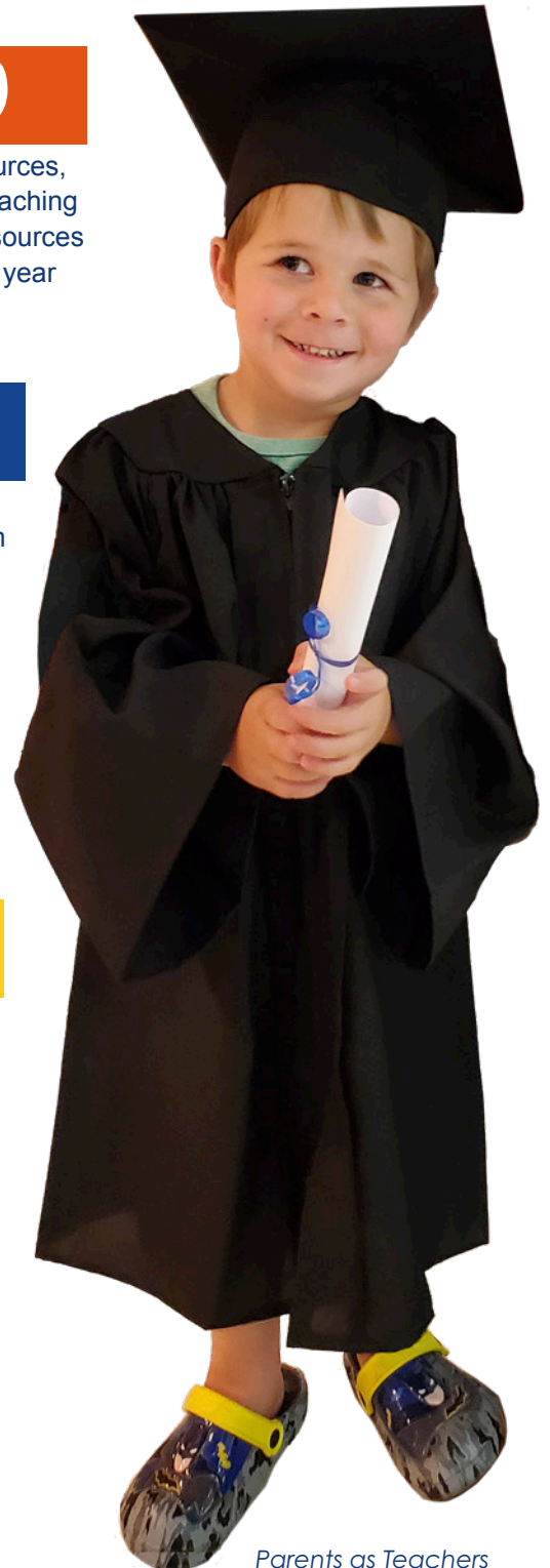
Parents as Teachers graduate Class of 2022

families with young children received guidance and counseling to improve their future through our First Steps initiative last year